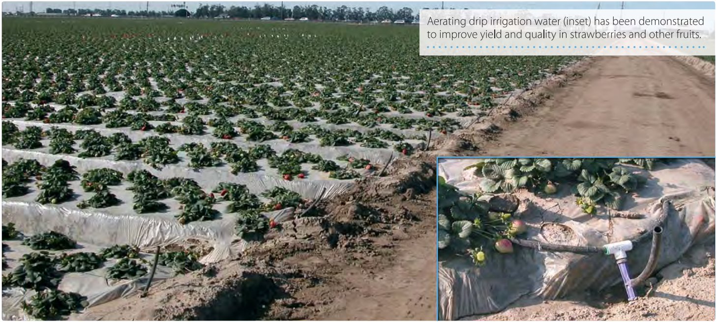
Aerating drip irrigation water (inset) has been demonstrated to improve yield and quality in strawberries and other fruits.

California State University, Fresno — used sophisticated DNA analysis and a growing understanding of the soil ecosystem to study the impact of the root aeration system on soil microbial populations in a replicated trial. Their experiment focused on the DNA of the microbes in their samples, which allowed them to measure the relative intensity — or a rough proportion — of various nitrogen-fixing and denitrifying-genetic material found in each treatment.