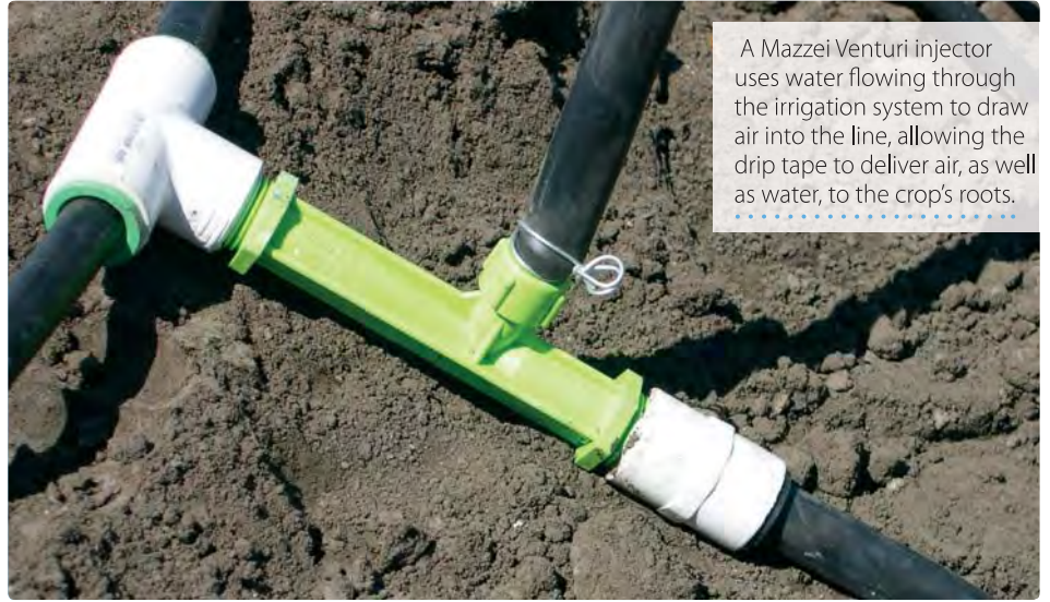
A Mazzei Venturi injector uses water flowing through the irrigation system to draw air into the line, allowing the drip tape to deliver air, as well as water, to the crop’s roots.

Like the human-scale world atop the soil, Eisenberg’s buried marketplace is fueled by oxygen (and nitrogen, which is the building block for protein in us and the plants we cultivate). In fact, oxygen and nitrogen are inextricably linked in the soil. The balance of microbes beneath the surface dictates whether nitrogen will be fixed in the soil from the atmosphere, converted to plant-friendly nitrate or ammonium, or denitrified and bled off as gas into thin air.