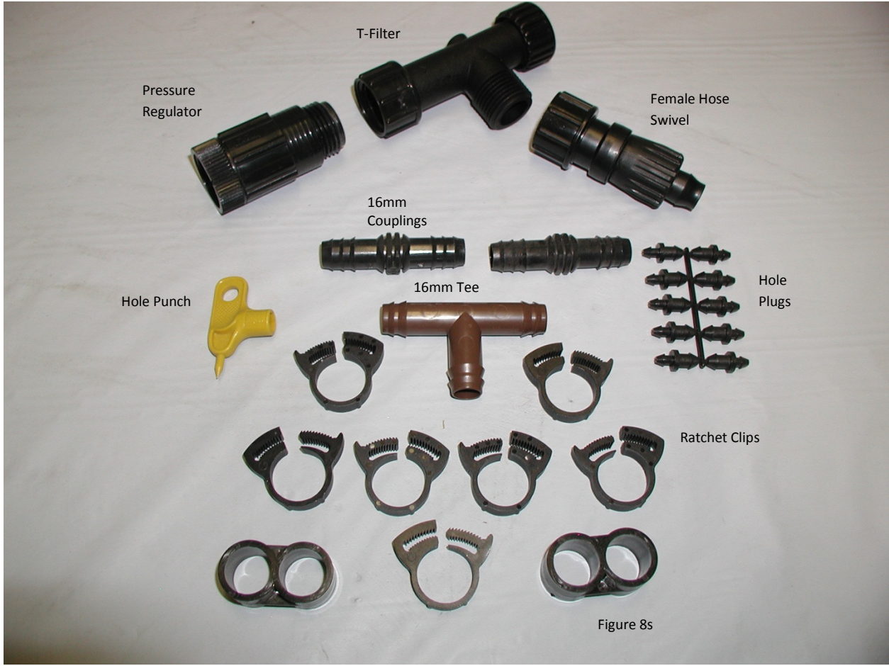
Figure 1: Part names