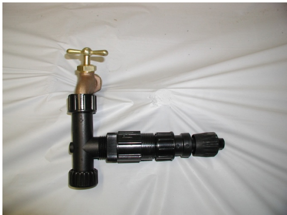
Figure 1: Faucet hook-up