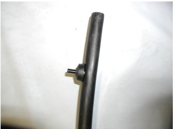
Figure 3: Emitter punched into line