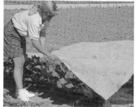
Other products available like Deer Fence, Bird Net, Natural Burlap, Erosion Control, Filter Fabric, Tarps and more.